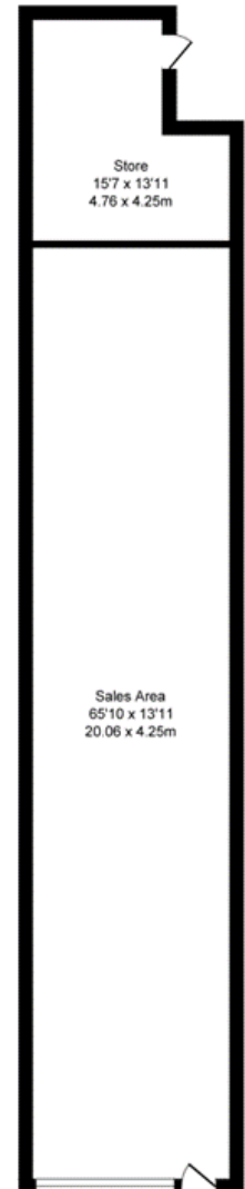
Approx. Floor Area 1103 Sq.Ft (102.5 Sq.M.)